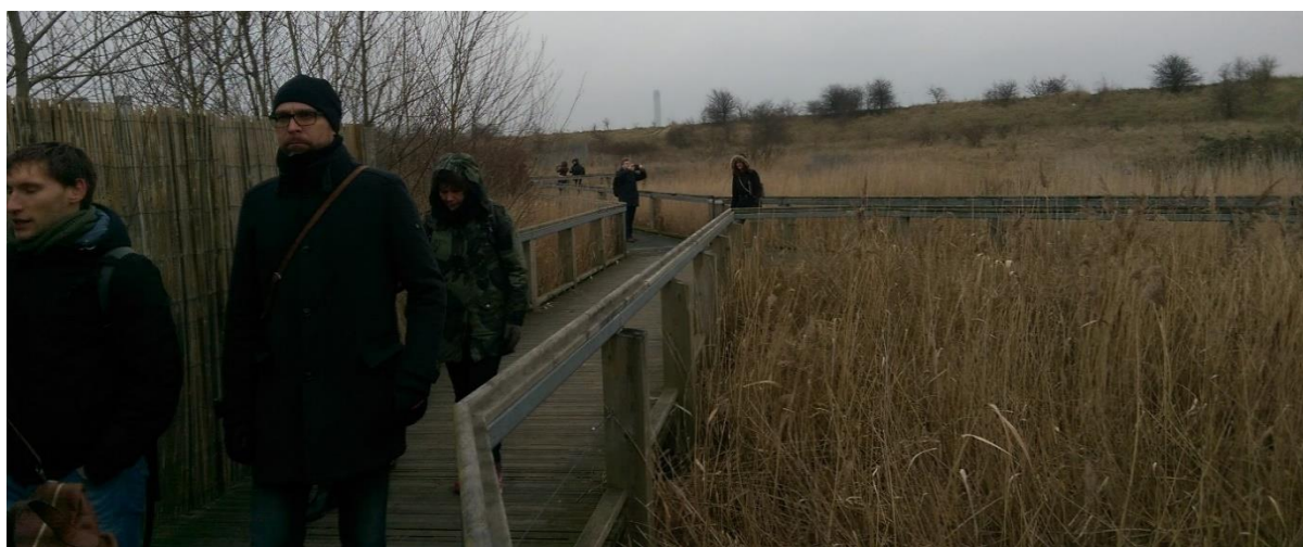
The PERFECT partners walking through Rainham Marshes RSPB reserve