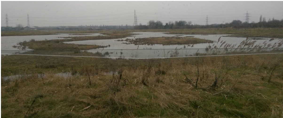
The view of Rainham Marshes RSPB reserve from the bird hide