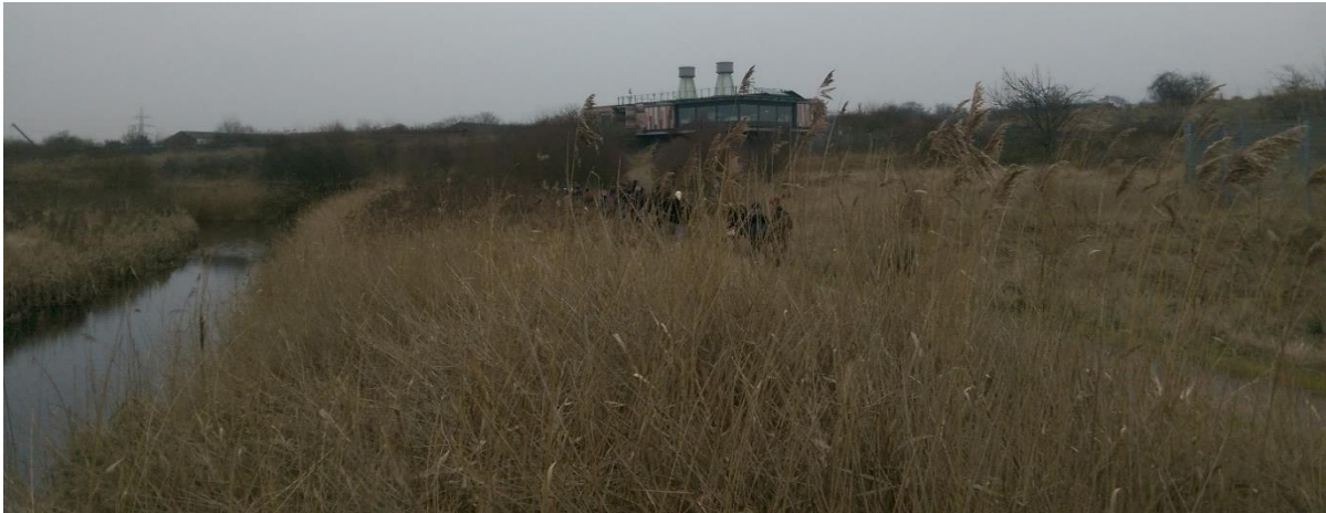
Rainham Marshes RSPB reserve, with a view of the environmentally-friendly visitor centre