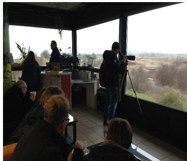
In the visitors centre