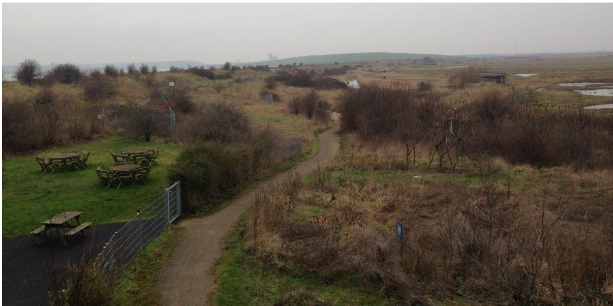
The view of Rainham Marshes RSPB reserve from the visitor centre