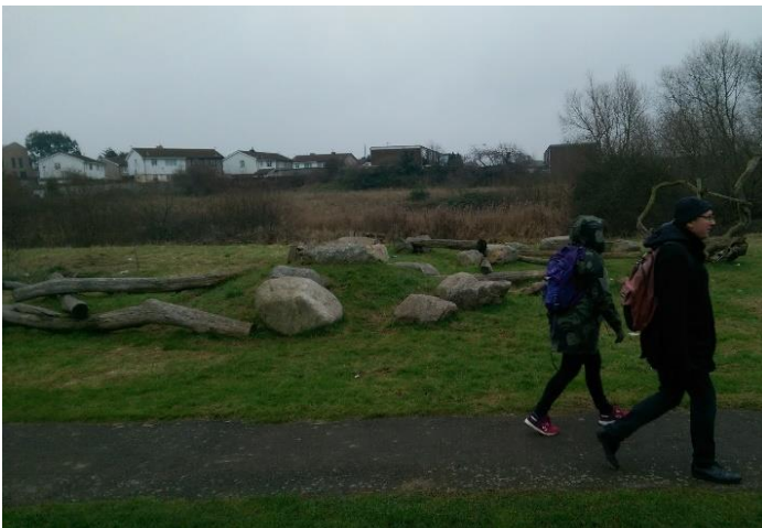
One of the areas of natural play equipment