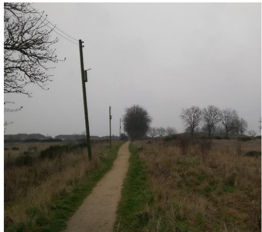
The park has eight kilometres of pathways